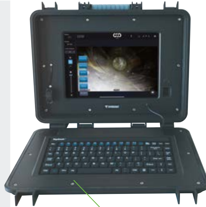
Protective Monitor & Keyword Case for Efficient, On-the-Job Reporting

Control the camera, capture data, and share reports wirelessly, maximizing convenience and productivity on the job.