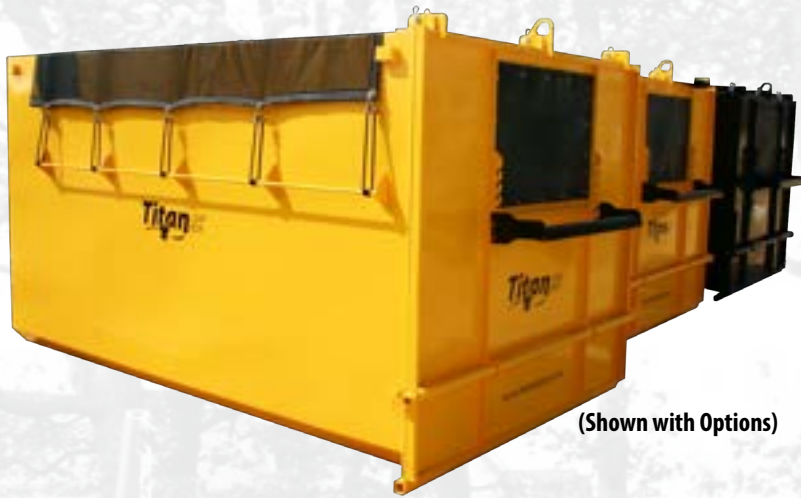
(Shown with Options)