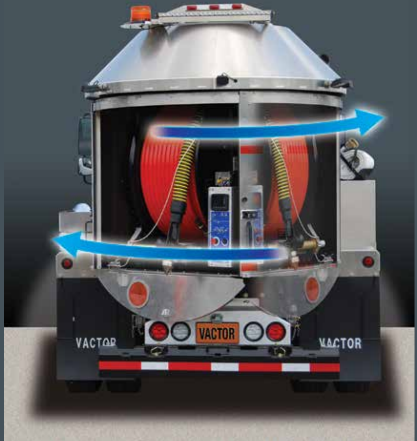
The reel can rotate a total of 180 degrees, 90 degrees to curb side and 90 degrees to street side providing direct alignment to manholes.