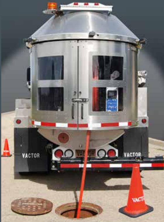
The revolutionary rotating hose reel with integral shroud.