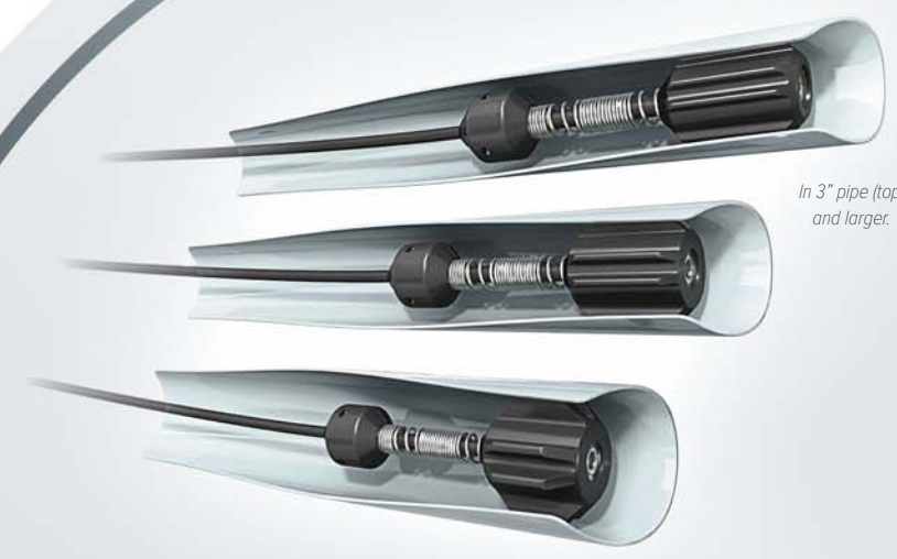
In 3" pipe (top) and larger.

Though VeriSight Pro inspects pipes as small as 2", you can optimize your view in lines 3" and larger using the supplied adapter kit (includes three centering devices, maneuverability collar, and wrench for quick installation).