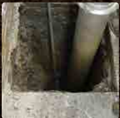
Visually locate underground utilities in tight spaces