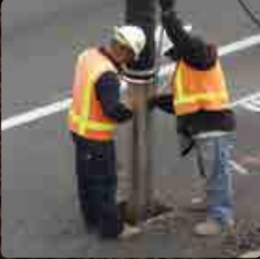
Key hole repairs