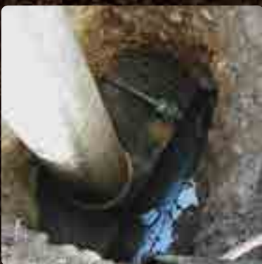
Water valve box repair or utility & line locating