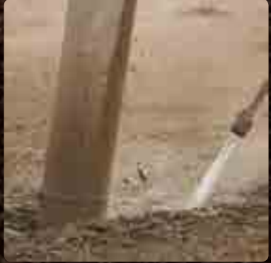
Water or air excavation